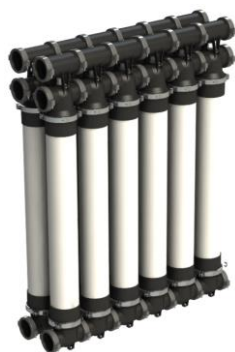
Fig. 1: ZW700B-RMS 2x6 configuration

As a pioneer of membrane technology, SUEZ leverages decades of research, development, and operational experience to offer one of the most advanced ultrafiltration technology in the market. The ZeeWeed 700B RMS (Figure 1) line of products contains our SevenBore* fiber technology with an inside-out flow orientation. The SevenBore fiber is regarded as a leading polyethersulfone (PES) product on the market.